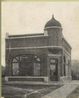
First National Bank of Owasso

Visit the Owasso Museum to learn more about Owasso's history.